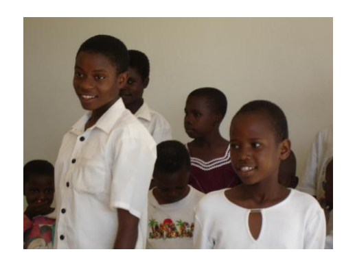
Who runs it?

Upendo Orphans Project provides orphans in a small town in coastal Kenya with food, education and support. The orphans live with guardians in order to give them a family environment.